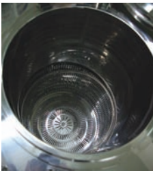
DK-AC 010 Inner Shape